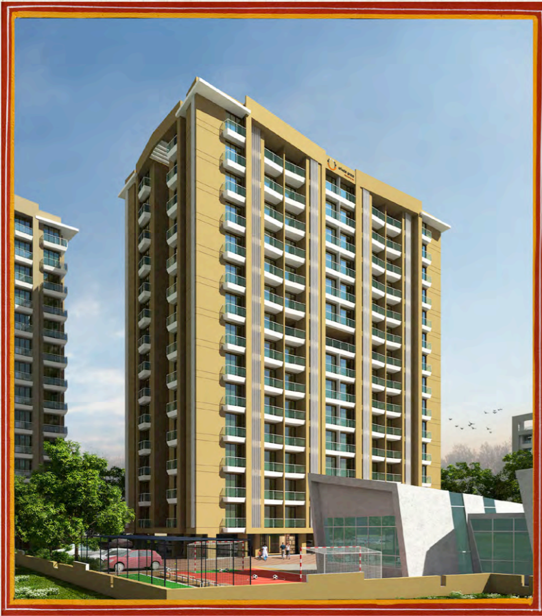
Tower Two - exterior view, front facing.