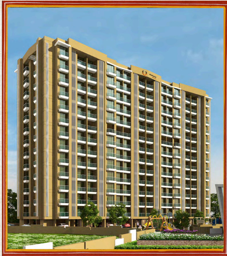
Tower Three - exterior view, front facing.