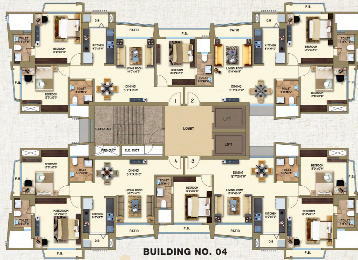
Tower Four - floor plan