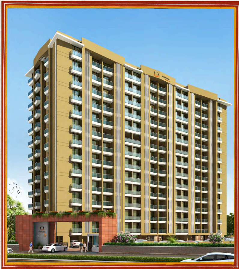
Tower One - exterior view, front facing.