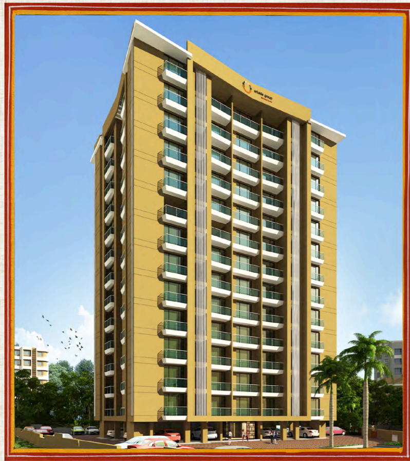
Tower Four - exterior view, front facing.