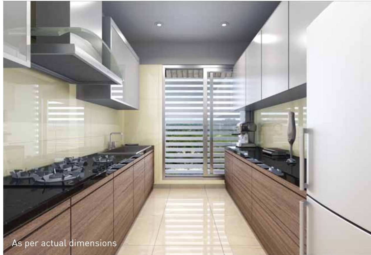
As per actual dimensions